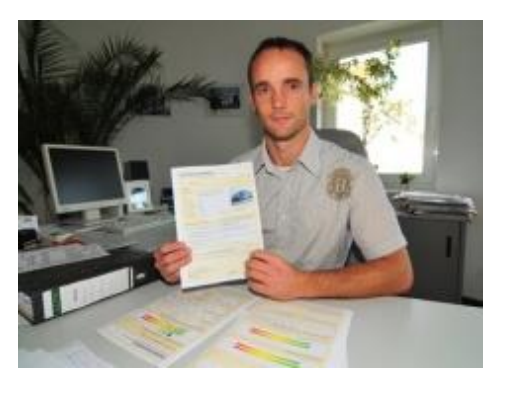
Energy Pass for buildings